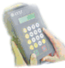
Remote Hand Console