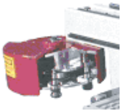
Automatic Tool Changer

● SAVE TIME ● SAVE MONEY ● REDUCE WASTE ● IMPROVE ACCURACY